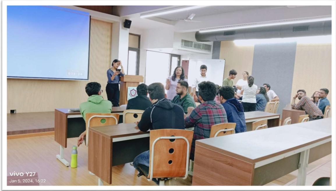
Quiz Competition top 3 Winning teams receiving certificates